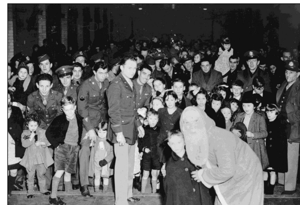
The Americans host a Christmas party for orphans from the Foundling Hospital, Berkhamsted, in 1943.