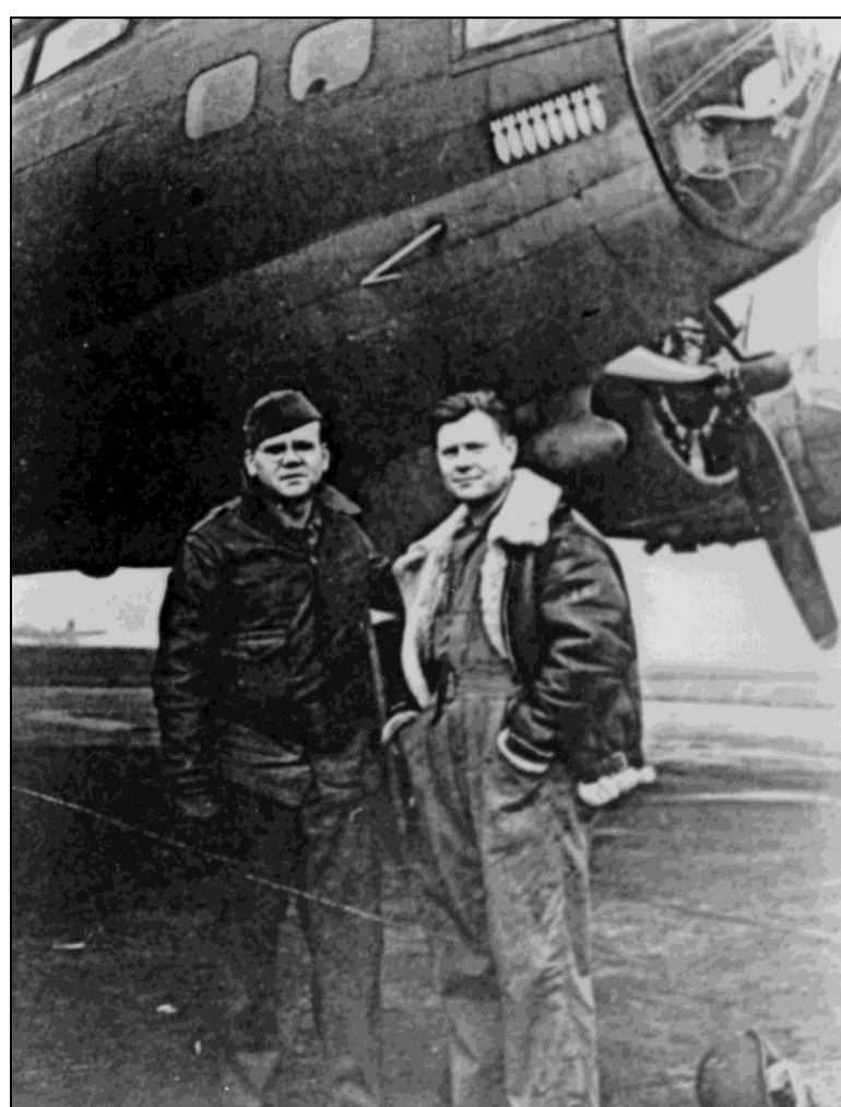
Flying Fortress aircrews (above and below). (DACHT: 62.24.7)