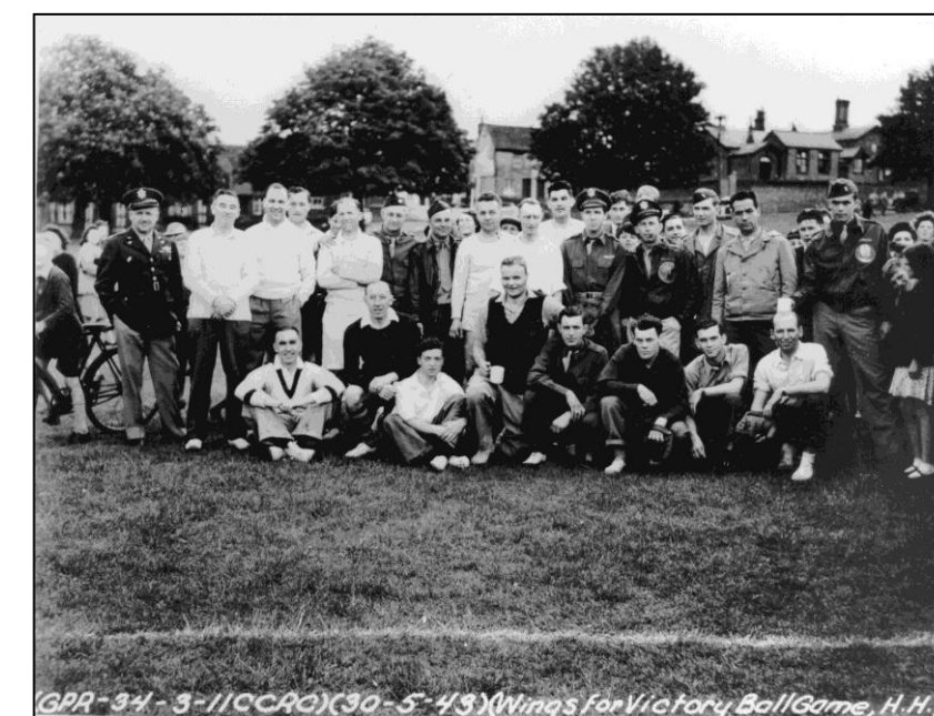
USAAF Bovingdon softball match at Boxmoor cricket ground, May 1943. Locals and Americans alike were briefed as to the peculiar habits of each other. There were a number of local girls who became GI brides and emigrated at the end of the war.