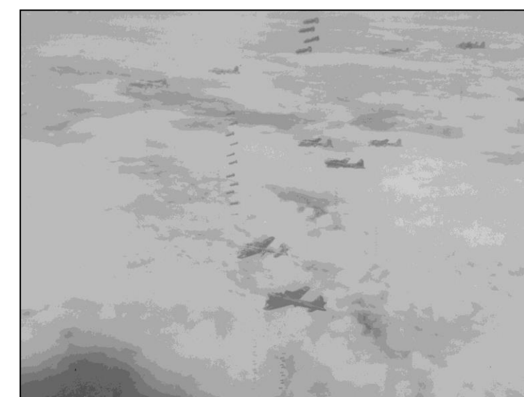
B17 Flying Fortresses on a daylight raid. (DACHT: 62.44.6)