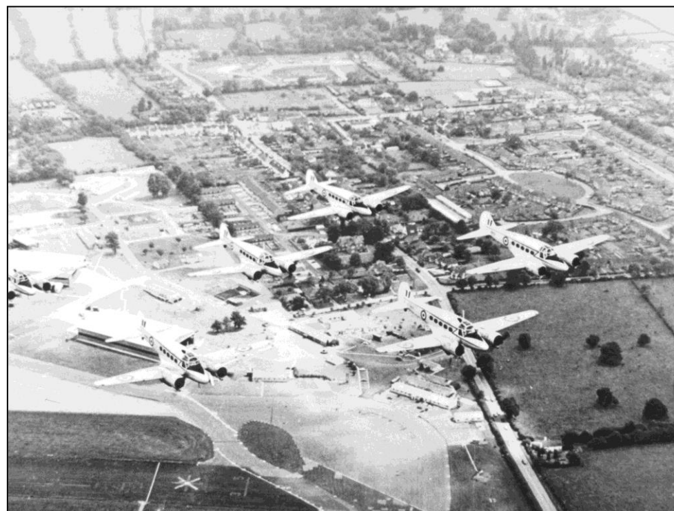
Four heavy bombing missions were flown from the airfield during the autumn of 1942 (DACHT: 62.24.4)

The 7531st departed in 1962 and in 1968 the Ministry of Defence announced that Bovingdon was one of several airfields due for closure. All that remains today is the derelict Air Traffic Control, as HM Prison The Mount now occupies a large part of the site.