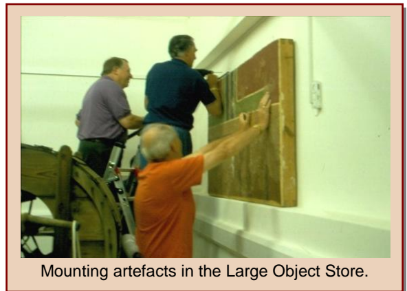
Mounting artefacts in the Large Object Store.

On 3rd October 1994 the first stage of the move began. Berkhamsted's precious main collection, stored in the attic of Gable House in Prince Edward Street, required a human chain of volunteers to negotiate the narrow and steep staircase with others to ferry the items, some like the sewing machine being both heavy and awkward, across the yard to the Reception Bay. After fumigation treatment objects could finally be taken to their permanent location. It took several years to sort, catalogue and store all our collection and volunteering by the History Society continues to this day. The friendship of those original, now sadly depleted volunteers, remains with memories of the enjoyment obtained from working in a team and being appreciated.