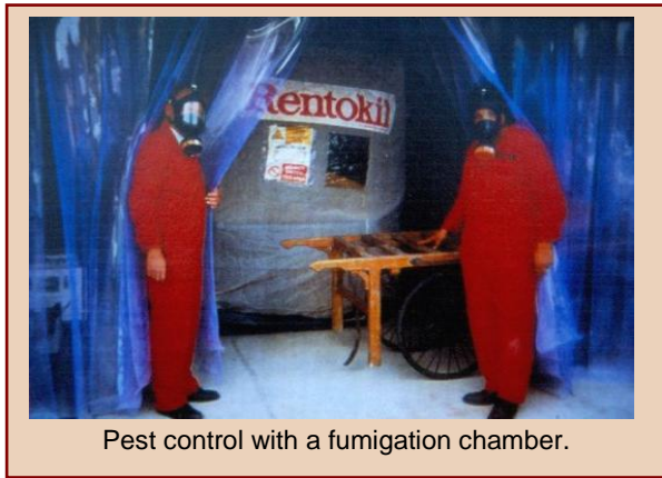
Pest control with a fumigation chamber.