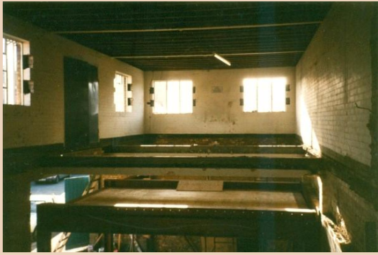
The garage originally had very high ceilings to accommodate the fire tenders so the upper level floor was lowered, and became the General Store with the Sensitive Store at the far end.

Local societies were not keen on giving away collections to an untried and untested Heritage Trust. At that time, the Museums and Galleries Commission (MGC) was doubtful about offering grant aid to an organisation that did not own its collections. There was some talk of a 'gentleman's agreement' but I felt this would not satisfy professional bodies such as the MGC. My own view was that the care of the collections was more important than ownership; we eventually agreed a form of words to satisfy everyone (more or less!). The Trust could also then build up its own collection. Eventually, when the store came along and societies could see the collection being housed, conserved, documented and displayed – at no cost to them - then the question of ownership became less important.