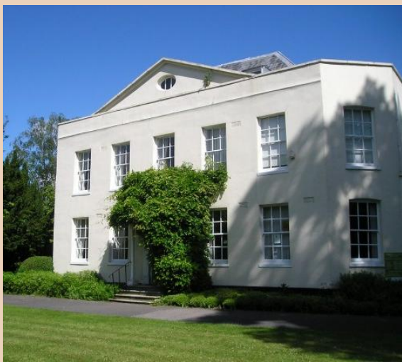
The Bury in Queensway, Hemel Hempstead.

It is a matter of profound pleasure that this celebratory DHT Newsletter provides the opportunity for the first public announcement that this long-held ambition may now be moving towards fruition. It is a matter that has been discussed at great length between Dacorum Borough Council (DBC) and ourselves in confidence for two years. It has just been agreed that last years' first joint meeting by DHT, DBC and the Heritage Lottery Fund, can now be followed up by a more detailed discussion in the very near future, since funding remains an important factor.