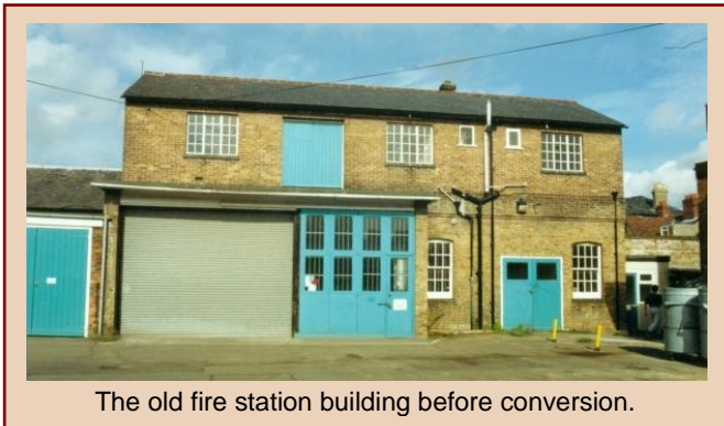
The old fire station building before conversion.