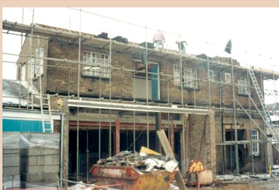
A lot of scaffolding and a new roof.