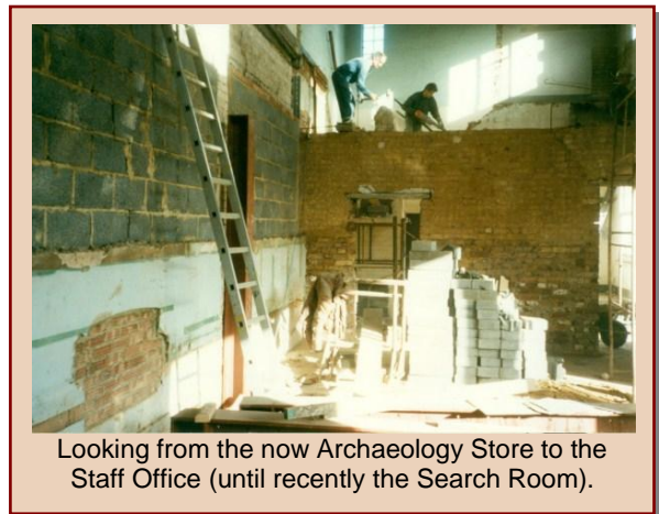
Looking from the now Archaeology Store to the Staff Office (until recently the Search Room).